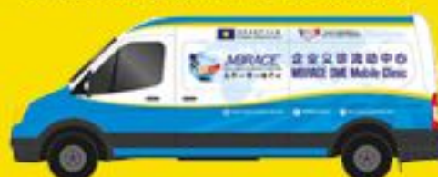
MBRACE SME Mobile Clinic

Free business consulting services & One Belt, One Road Information