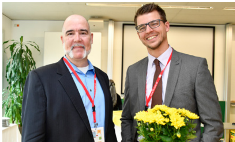
The friendly atmosphere in Steyr invites visitors and presenters to exchange ideas and network.